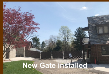
New Gate installed