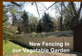
New Fencing in our Vegetable Garden