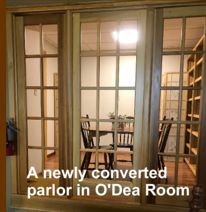
A newly converted parlor in O'Dea Room