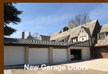
New Garage Doors