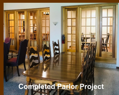
Completed Parlor Project