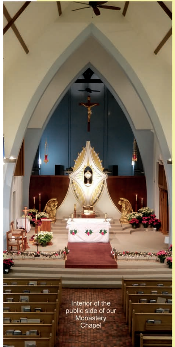
Interior of the public side of our Monastery Chapel