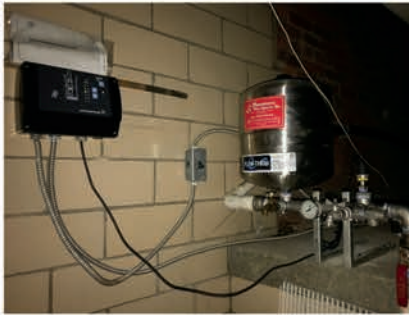
Water Well System