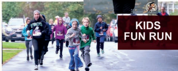
KIDS FUN RUN