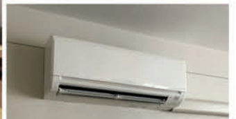
New HVAC system installed in our gathering places in our first floor