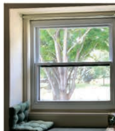
New windows in our Formation classroom