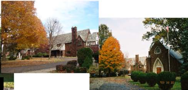
Site of our new kitchen

This renovation will be undertaken in the near future. The estimated cost will not exceed $200,000. We beg your prayers and on-going financial assistance for this endeavor. In the meantime, the Soup and Bread will continue as usual.